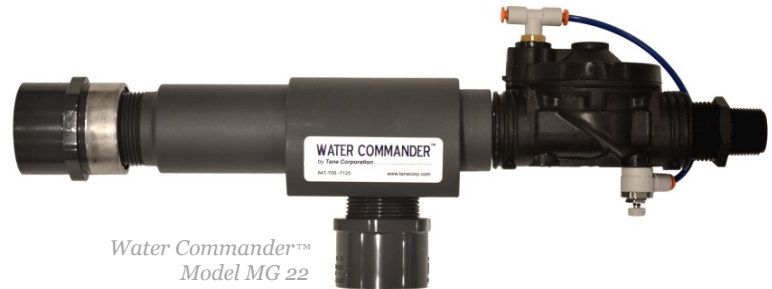
Water Commander™ Model MG 22